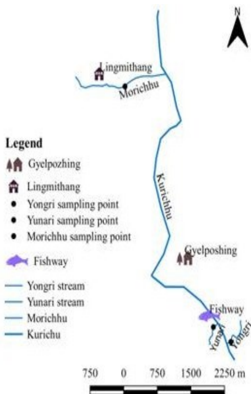
Figure 1: Study area along the Kurichhu HEP in Mongar

above the dam; and from Yunari stream the downstream tributaries that join the right bank of Kurichhu, approximately 0.300 km below the dam; and the Yongri, a small stream that joins the left bank of Kurichhu, approximately 0.800 km below the dam as presented in Figure 1.